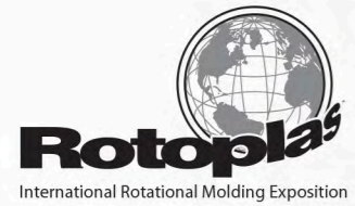
EXHIBIT HOURS WED. SEPT. 27 1:30-6:30 PM THUR. SEPT. 28 12:00-5:00 PM